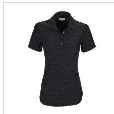
Black Heather (WNS9K478-BHT)