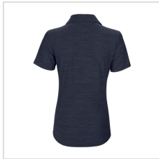
Greg Norman Ladies Play Dry Heather Solid Polo*