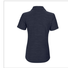
Greg Norman Ladies Play Dry Heather Solid Polo*