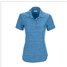
Atlantic Blue Heather (WNS9K478-ABH)