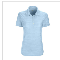
Blue Mist Heather (WNS9K478-BMR)