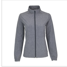
Navy Heather (WNS8J050-NHR)