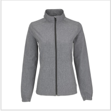
Black Heather (WNS8J050-BHT)