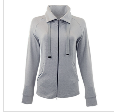
Grey Heather (WNS4J471-GHR)