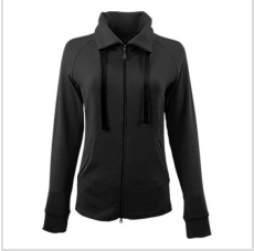
Black Heather (WNS4J471-BHT)