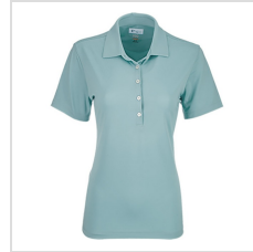
Ocean Breeze (WNS2K450-OBZ)