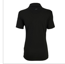
Greg Norman Ladies Freedom Polo*