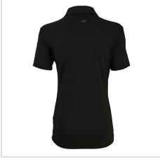
Greg Norman Ladies Freedom Polo*