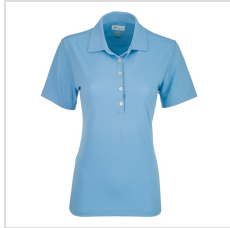
Coastal Blue (WNS2K450-CSB)