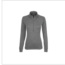
Dark Heather (WNS2K074-DHR)