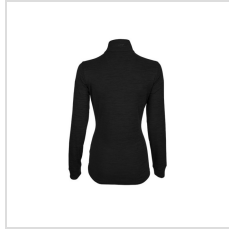
Greg Norman Ladies Utility 1/4 Zip Pullover*