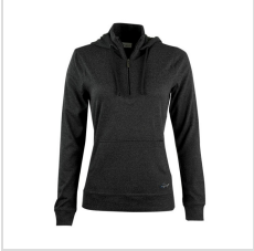
Black Heather (WNF2K722-BHT)