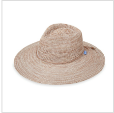
Mixed Camel (VICFD-MC)