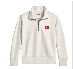
Vintage White Applique Custom Logo