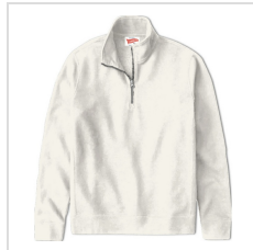
Vintage White (U402A-VW)