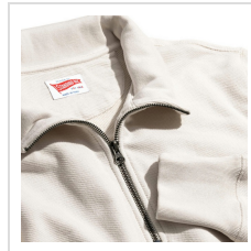
Vintage White (U402A-VW)