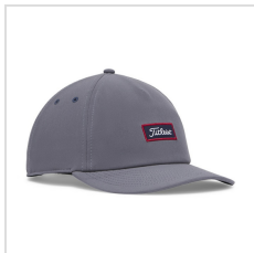
Washed Indigo/Navy/Crimson (TH26ASCRKC-446)