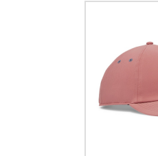
Sedona/Washed Indigo (TH26ASCRKC-64)