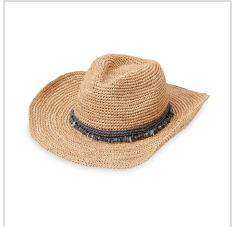
Dusty Blue (TCOW-DB)