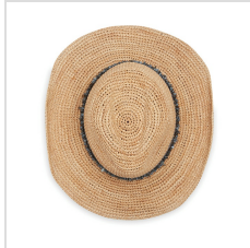
Dusty Blue (TCOW-DB)