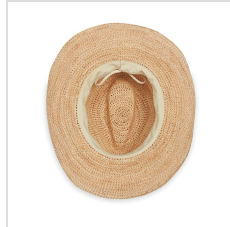
Dusty Blue (TCOW-DB)