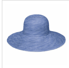
Hydrangea/White Dots (SCR-HD)