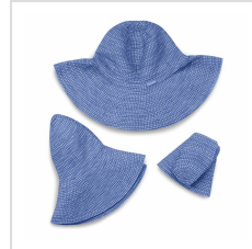
Hydrangea/White Dots (SCR-HD)