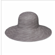
Grey/White Dots (SCR-GR)