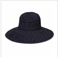
Black/White Dots (SCR-BK)