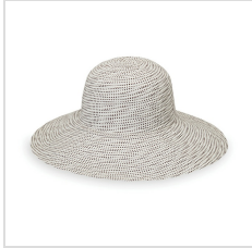
Natural/Brown Dots (SCR-NA)