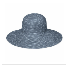
Slate Blue/White Dots (SCR-SL)