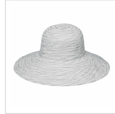
White/Black Dots (SCR-WH)