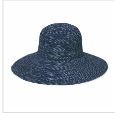
Navy/White Dots (SCR-NY)