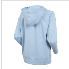
Blue Bell Melange (S77517-33M)