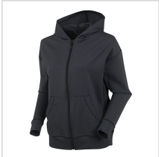
Black Melange (S77517-02M)