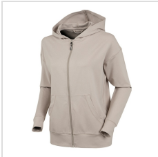
Atomosphere Melange (S77517-76M)