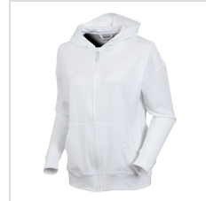
Pure White (S77517-04)