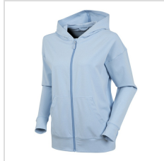
Blue Bell Melange (S77517-33M)