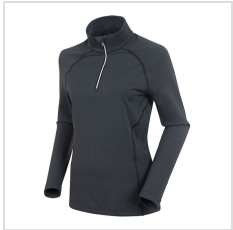
Black Melange (S77516_02M)