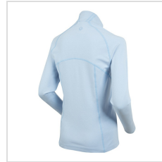
Blue Bell Melange (S77516-33M)