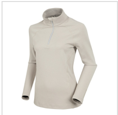
Taupe Melange (S77516-724M)