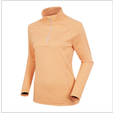
Cantaloupe Melange (S77516-74M)