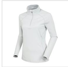
Down Grey Melange (S77516-08M)