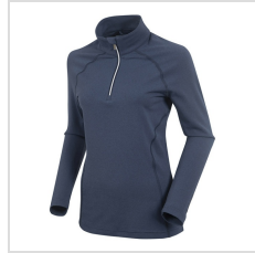
Midnight Melange (S77516-31M)