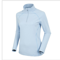
Blue Bell Melange (S77516-33M)