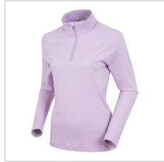
Lupin Melange (S77516-39M)