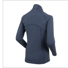
Midnight Melange (S77516-31M)