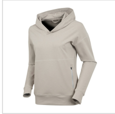
Taupe Melange (S77515-724M)