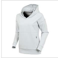
Down Grey Melange (S77515-08M)