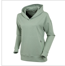
Frost Green Melange (S77515-55M)