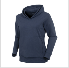
Midnight Melange (S77515-31M)