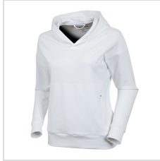
Pure White (S77515-04)