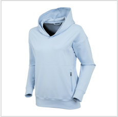
Blue Bell Melange (S77515-33M)