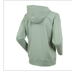
Frost Green Melange (S77515-55M)