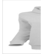
Atmosphere Melange (S77515-76M)