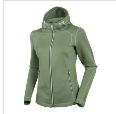
Forest Green (S77510-55)