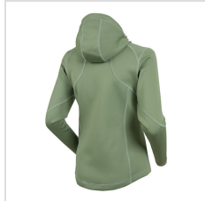
Forest Green (S77510-55)