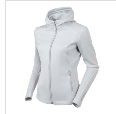
Oyster/Pure White (S77510-8404)