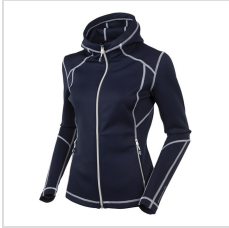
Midnight/ Pure White (S77510-3104)