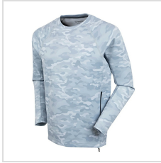
Magnesium Camo Print/Black (S77023-8602C)