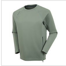
Sea Spray/Midnight (S77023-7531)