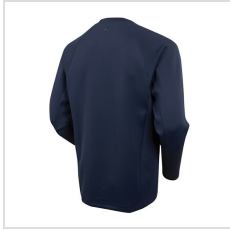
Sunice Allendale 2.0 Water Repellant Crew Neck