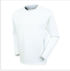
Pure White/Magnesium (S77023-0486)