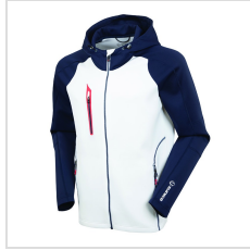
Pure White/Midnight (S77022-0431)