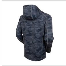
Charcoal Camo/Black (S77022-8502C)