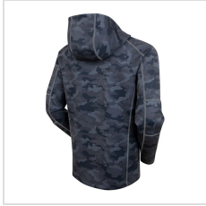
Sunice Allendale 2.0 Water Repellant Hooded Jacket