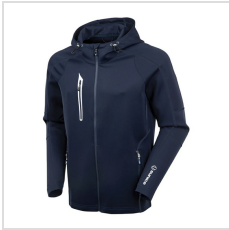
Midnight/Pure White (S77022-3104)