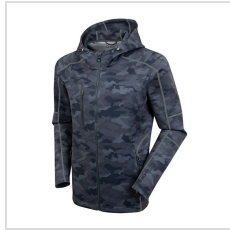
Charcoal Camo/Black (S77022-8502C)