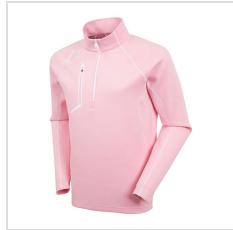
Pink/Pure White (S77018-6504)