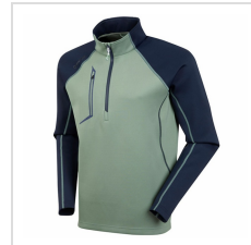
Sea Spray/Midnight (S77018-7531CB)