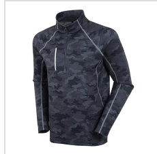
Charcoal Camo/Black (S77018-8502C)