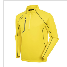
Empire Yellow/Midnight (277018-4331)