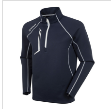
Midnight/Pure White (S77018-3104)