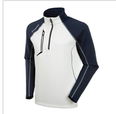
Pure White/Midnight (S77018-3104CB)