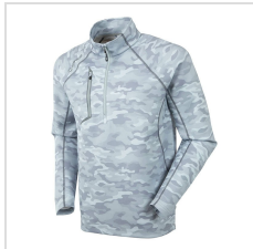
Magnesium Camo/Charcoal (S77018-8685C)