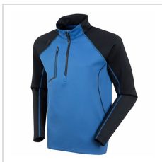
Twilight Blue/Black (S77018-7902CB)