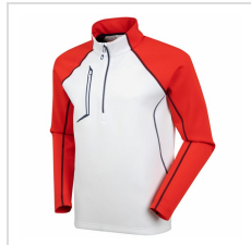
Scarlet Flame/Pure White (S77018-5104CB)