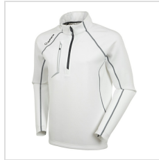
Pure White/Charcoal (S77018-0485)