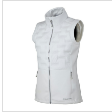
Pure White (S74525-04)