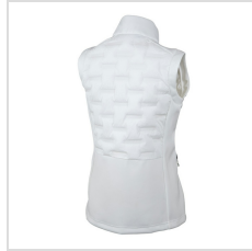
Pure White (S74525-04)