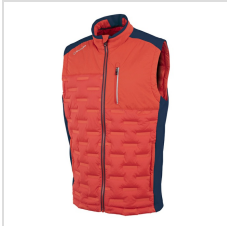
Scarlet Flame/Midnight (S74127_5131)