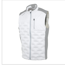
Pure White/ Magnesium (S74127-0486)