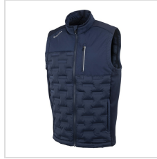
Midnight/ Midnight (S74127-3131)