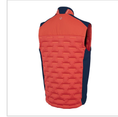
Scarlet Flame/ Midnight (S74127-5131)