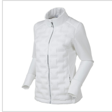
Pure White (S72510-04)