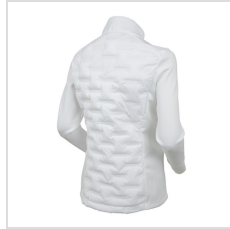
Pure White (S72510-04)