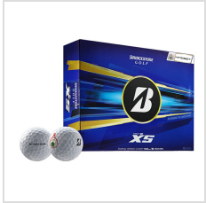
Dozen Box and Balls