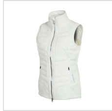
Pure White (S64507-04)