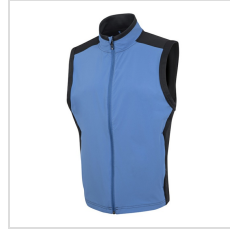
Twilight Blue/Black (S54100-7902)