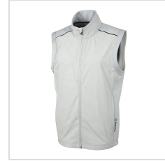
Magnesium Embossed Camo (S54100-86EM)