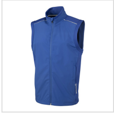
Blue Stone (S54100-23)