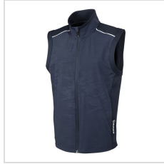
Midnight Embossed Camo (S54100-31EM)