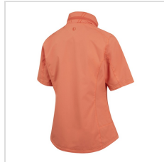
Living Coral (S53508-26)