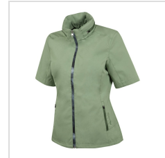
Forest Green (S53508-55)