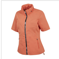
Living Coral (S53508-26)