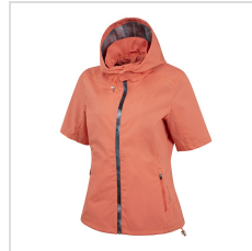
Living Coral (S53508-26)