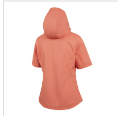
Living Coral (S53508-26)