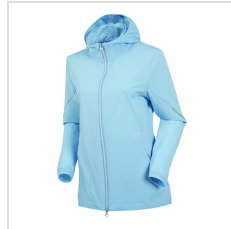
Blue Bell (S53507-33)