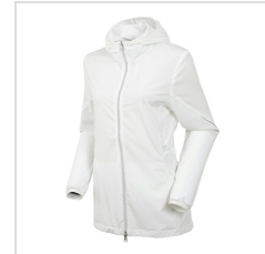
Pure White (S53507-04)