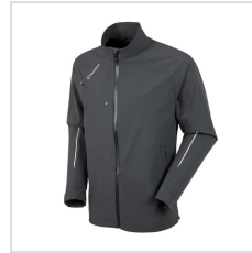
Charcoal/ Pure White (S53009-8504)