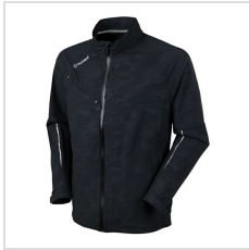
Black Camo Embossed (S53009-02EM)