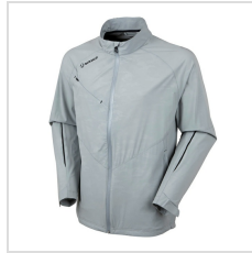
Magnesium Camo Embossed (S53009-86EM)