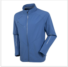
Twilight Blue/Silver (S53009-7998)