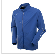
Blue Stone Magnesium (S53009-2386)