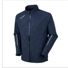
Midnight Camo Embossed(S53009-31EM)