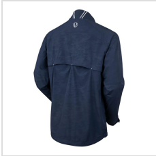
Midnight Camo Embossed (S53009-31EM)