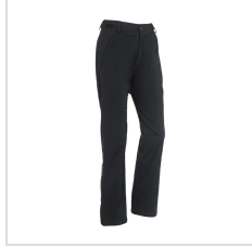
Black- 29" inseam (S46501-02L29)