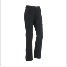
Black- 27" inseam (S46501-02L27)