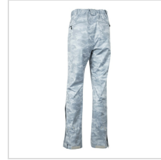
Magnesium Camo (S46001-86C)