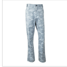
Magnesium Camo (S46001-86C)