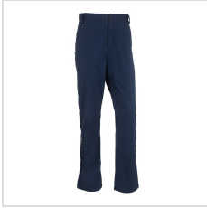
Midnight/ Pure White (S46001-3104)