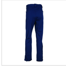
Midnight/ Pure White (S46001-3104)