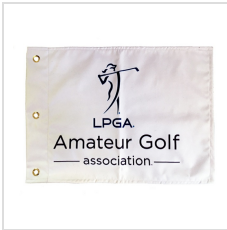
Sublimated Pin Flag with Grommets*