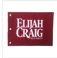
Sublimated Pin Flag with Grommets*