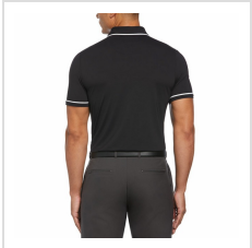
Caviar Black (OGKSE002-001)