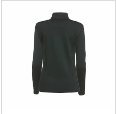
Caviar Black (OGKSB222-001)