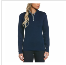
Black Iris Blue (OGKSB222-417)