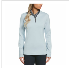
Pearl Blue (OGKSB222-059)