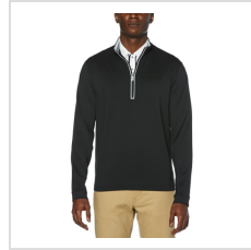
Caviar Black (OGKSA049-001)