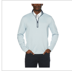
Pearl Blue (OGKSA049-059)