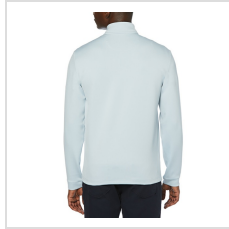
Pearl Blue (OGKSA049-059)