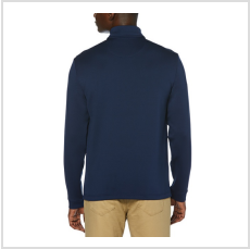
Black Iris Blue (OGKSA049-417)