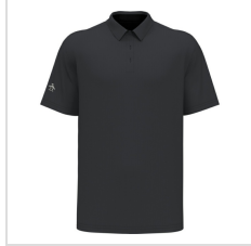
Caviar Black (OGKBA001-019)