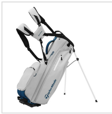
Silver/Navy- Ladies (N2650801)