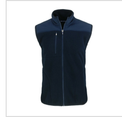
Navy Blue (MCO00084-NVBU)