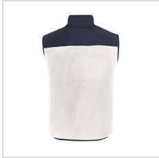
Cutter and Buck Cascade Eco Sherpa Fleece Vest