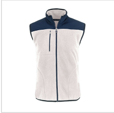
Shell/Navy Blue (MCO00084-SHNV)