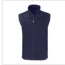
Navy Blue (MCO00083-NVBU)