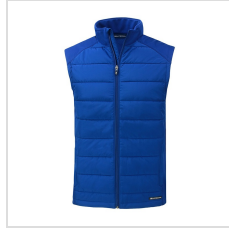
Tour Blue (MCO00076-TBL)