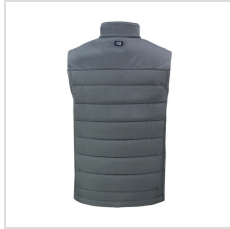
Cutter and Buck Evoke Hybrid Eco Softshell Recycled Full Zip Vest-