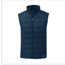
Navy Blue (MCO00076-NVBU)