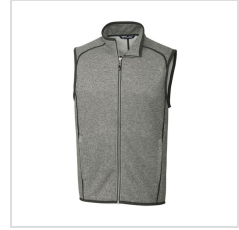
Polished Heather (MCO00047-POH)