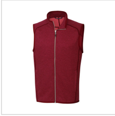
Cardinal Red Heather (MCO00047-CRH)