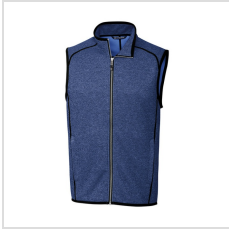
Tour Blue Heather (MCO00047-TBH)