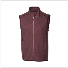
Bordeaux Heather (MCO00047-BRH)