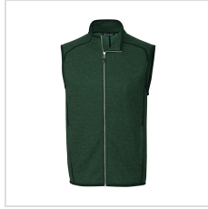
Hunter Heather (MCO00047-HH)