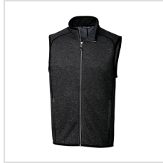
Charcoal Heather (MCO00047-CCH)