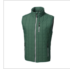
Hunter Melange (MCO00019-HNM)