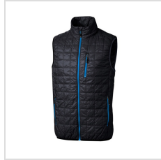
Dark Navy (MCO00019-DN)