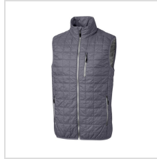
Anthracite Melange (MCO00019-ANM)