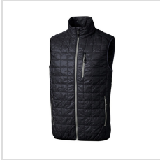
Dark Navy/Silver (MCO00019-DNSV)