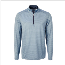
Atlas/Navy Blue (MCK01258-ALSNB)