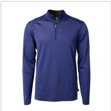
Tour Blue/Black (MCK01258-TLBL)