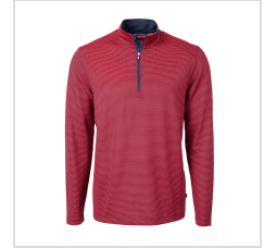
Red/Navy Blue (MCK01258-RDNV)