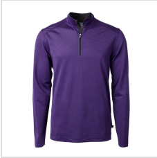
College Purple/Black (MCK01258-CPBL)