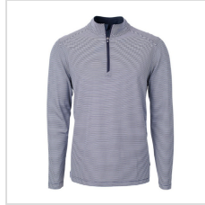
Navy Blue/White (MCK01258-NVBW)