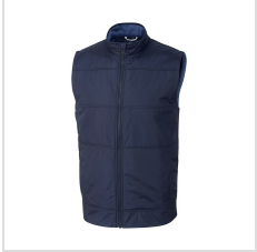
Liberty Navy (MCC00008-LYN)