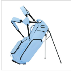
Light Blue (M2370401)