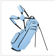
Light Blue (M2369801)