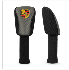
Synthetic Leather and Mesh Driver Cover with Dual Decoration*