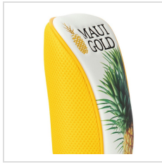
Synthetic Leather and Mesh Driver Cover with Dual Decoration*