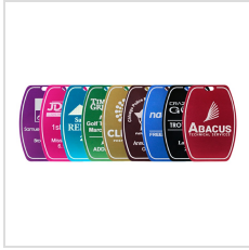
Bag Tag Colors