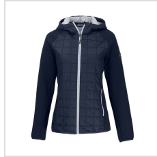
Dark Navy (LCO00073-DN)