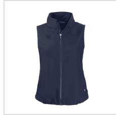
Navy Blue (LCO00068-NVBU)