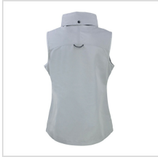
Cutter and Buck Ladies Charter Eco Recycled Full-Zip Vest*