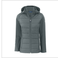
Elemental Grey (LCO00064-EG)