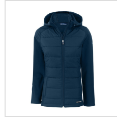
Navy Blue (LCO00064-NVBU)