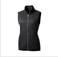
Charcoal Heather (LCO00058- CCH)