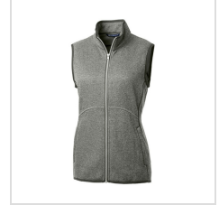
Polished Heather (LCO00058- POH)